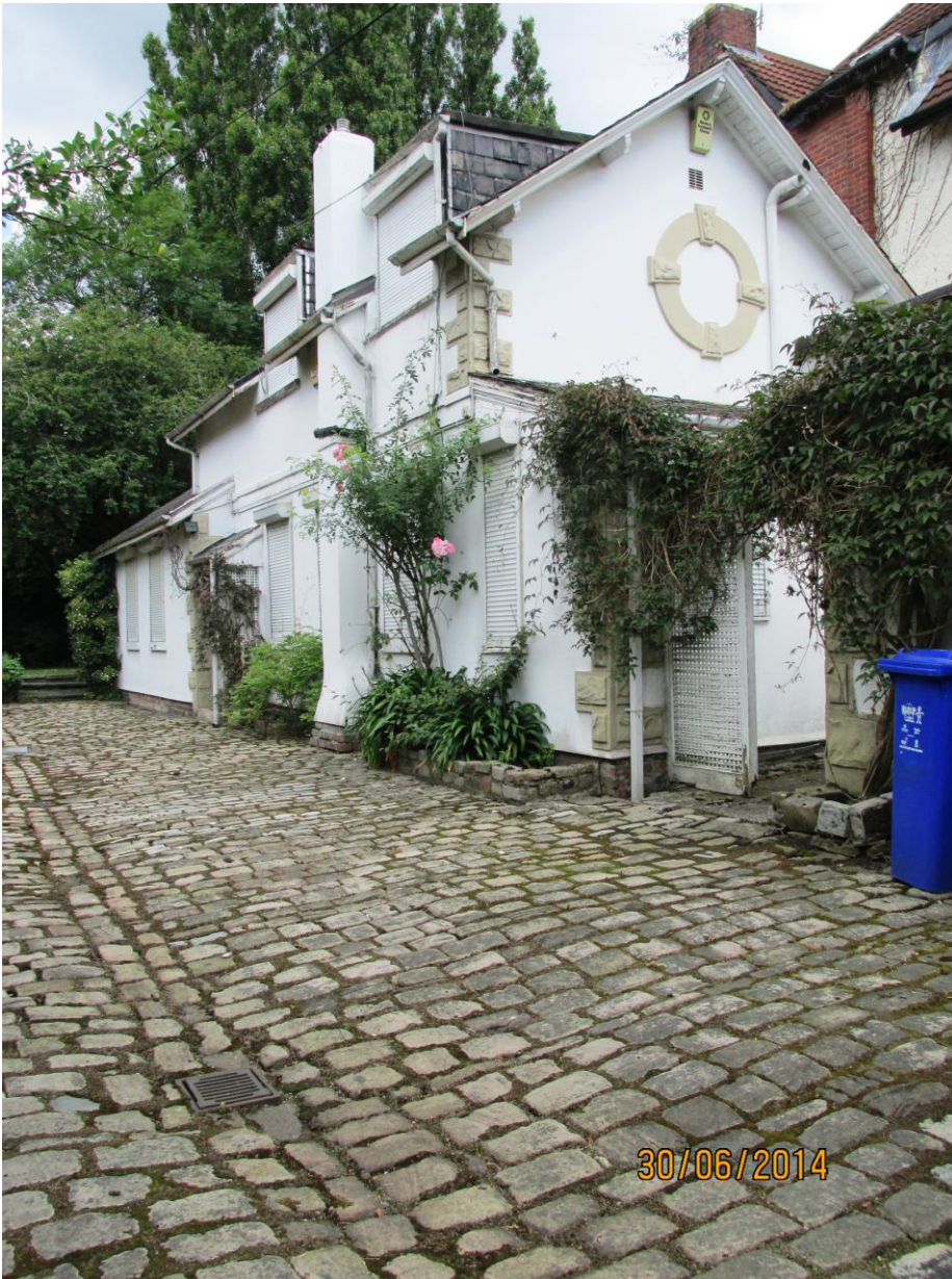
Remains of the former “South Lodge”, Dennison Road

Urban Design and Conservation Team Planning, Building Control and Licensing Department